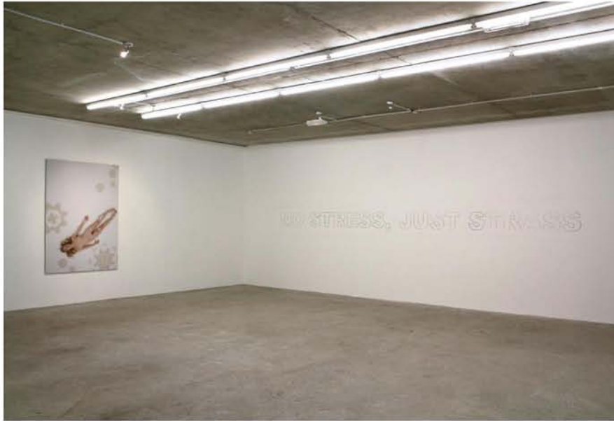
"NO STRESS, JUST STRASS" Vogue November 2005 Wall-piercing, neons inside the wall, 2007